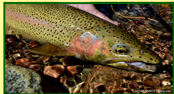
Rainbow Trout caught in the Jakey's Fork

"When kissin' a cowboy in the rain make sure you both fit under his hat." - A cowgirl's Guide to Life