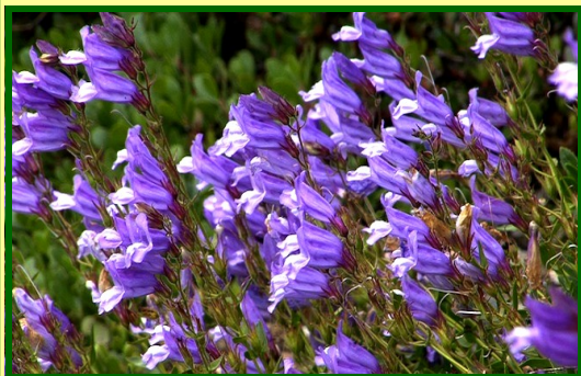
Penstemon Wildflowers in June