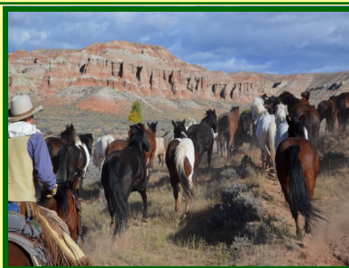
Horse drive to Button Draw