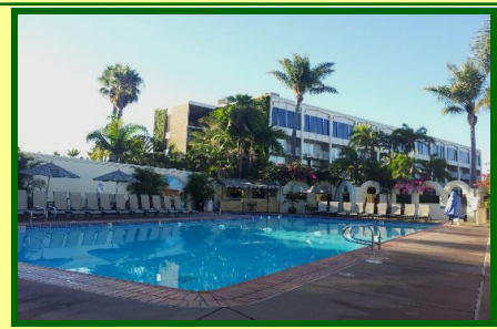
Bahia Resort in San Diego

"Trust your neighbor, but brand your cattle" - Cowgirl quotes