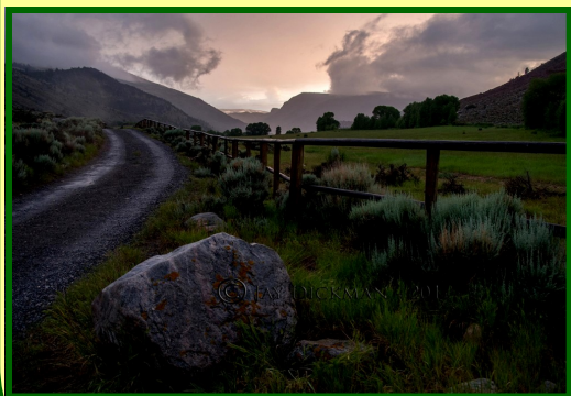
Early summer sunset