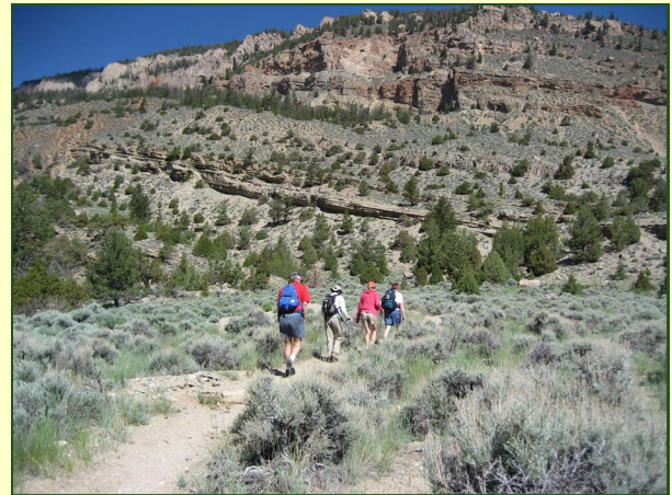
Guests hiking to Lake Louis